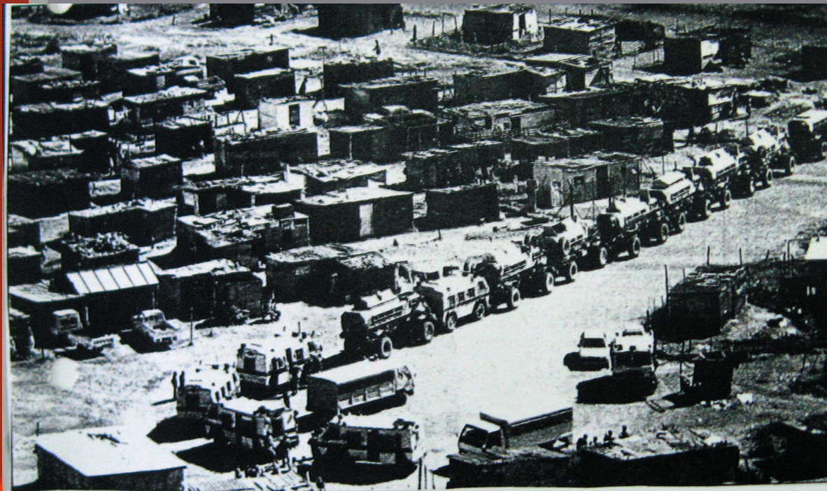
8/6/93 South African Defence Force and SA Police vehicles form a ring of steel around the Mandela squatter camp in Katlehong on the East Rand while security force members conduct shack-to-shack searches early yesterday. Sixty-six people were arrested and a large quantity of arms, including AK-47 rifles and ammunition, was seized during the swoop.

Goldstone Commission blames “irresponsible” media for fueling violence with “false rumours” and “unsubstantiated allegations”.