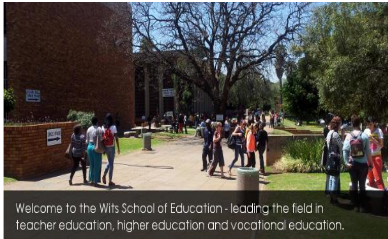
Welcome to the Wits School of Education - leading the field in teacher education, higher education and vocational education.

From the trenches of the Somme to the trenches of the history classroom”